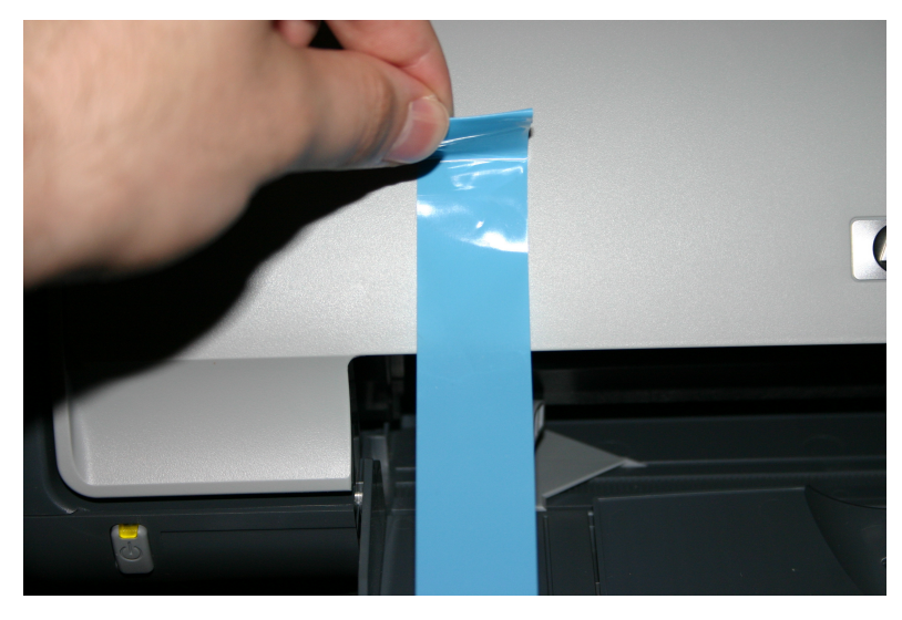
1. \ Unpack: take \ tape \ off \ and \ any \ cardboard \ out