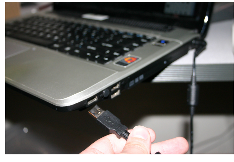
5. Plug USB cable into computer