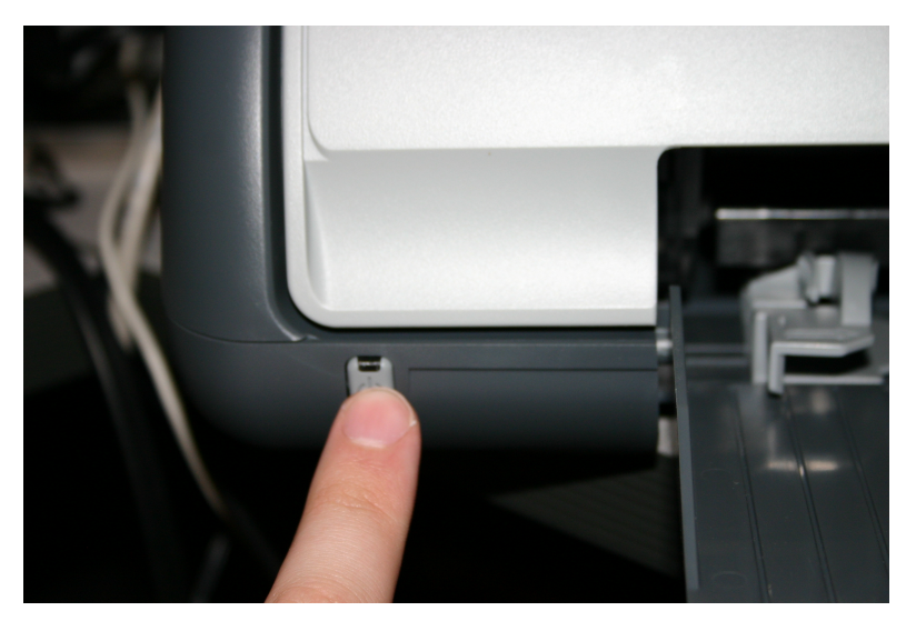
3. Power printer on