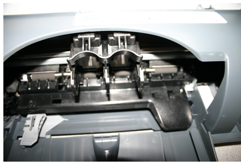
4. Follow directions on printer and insert cartridges