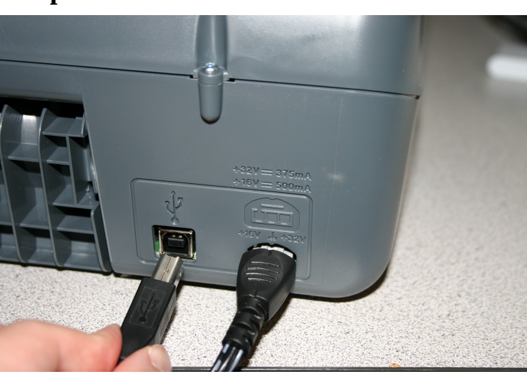
2. Plug power and USB cables in